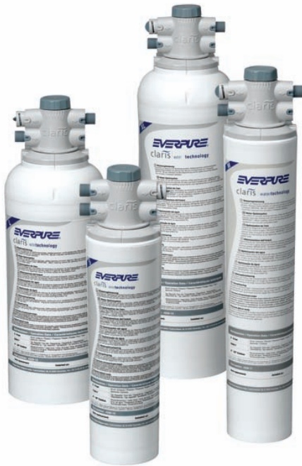
Claris Small Cartridge: EV4339-10 Claris Medium Cartridge: EV4339-11 Claris Large Cartridge: EV4339-12 Claris XLarge Cartridge: EV4339-13 Claris Head: TBA

Adjustable ion-selective filters to tailor carbonate hardness levels in potable water